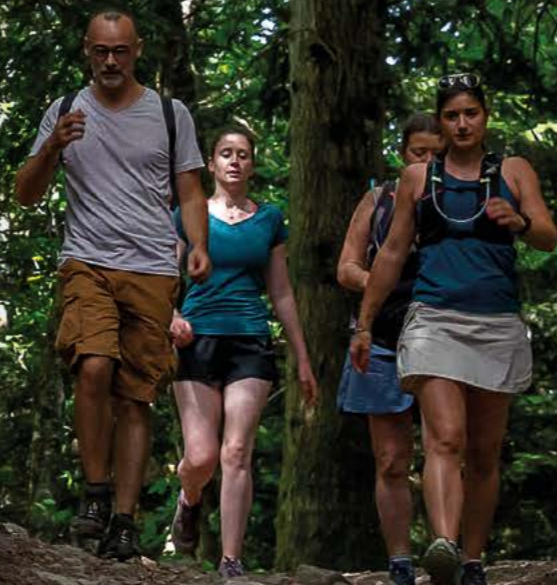
Hiking at Mont-Saint-Rigaud