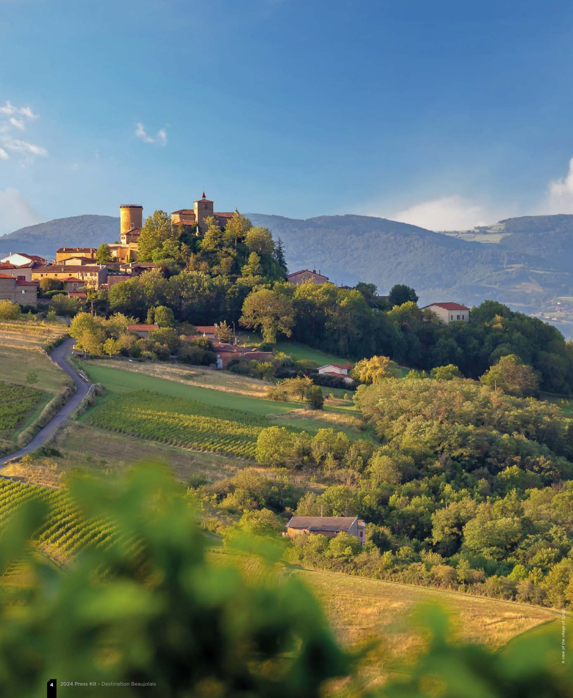
A view of the village of Chagny